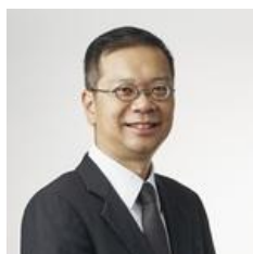
Tan Boon Gin

Commissioner SECURITIES AND EXCHANGE COMMISSION PHILIPPINES